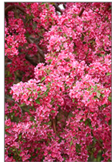
Prairifire Flowering Crab flowers