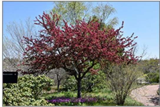
Adams Flowering Crab in bloom

Adams Flowering Crab is recommended for the following landscape applications;