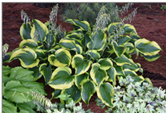
Atlantis Hosta

Atlantis Hosta is recommended for the following landscape applications;