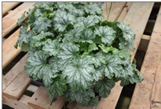
Paris Coral Bells foliage

Paris Coral Bells will grow to be about 8 inches tall at maturity extending to 14 inches tall with the flowers, with a spread of 14 inches. When grown in masses or used as a bedding plant, individual plants should be spaced approximately 12 inches apart. Its foliage tends to remain low and dense right to the ground. It grows at a medium rate, and under ideal conditions can be expected to live for approximately 10 years. As an evergreen perennial, this plant will typically keep its form and foliage year-round.