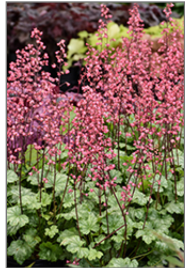
Paris Coral Bells flowers

Paris Coral Bells is recommended for the following landscape applications;