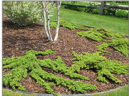
Dwarf Japanese Garden Juniper

This shrub should only be grown in full sunlight. It is very adaptable to both dry and moist growing conditions, but will not tolerate any standing water. It is considered to be drought-tolerant, and thus makes an ideal choice for a low-water garden or xeriscape application. It is not particular as to soil type or pH. It is highly tolerant of urban pollution and will even thrive in inner city environments. This is a selected variety of a species not originally from North America.