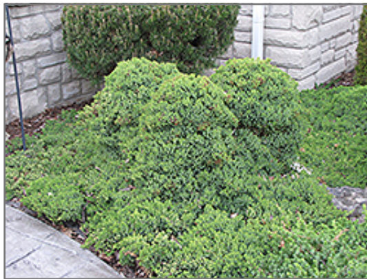
Dwarf Japanese Garden Juniper

Dwarf Japanese Garden Juniper is recommended for the following landscape applications;