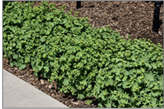
Gold Strike Lady's Mantle in bloom

This plant performs well in both full sun and full shade. It is very adaptable to both dry and moist locations, and should do just fine under typical garden conditions. It is not particular as to soil type or pH. It is highly tolerant of urban pollution and will even thrive in inner city environments. This particular variety is an interspecific hybrid. It can be propagated by cuttings; however, as a cultivated variety, be aware that it may be subject to certain restrictions or prohibitions on propagation.