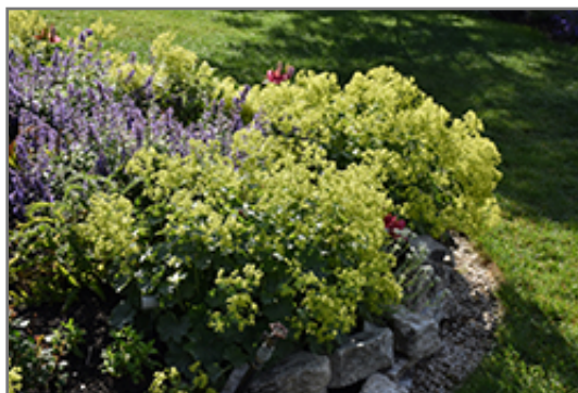
Gold Strike Lady's Mantle in bloom