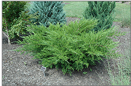
Sea Green Juniper