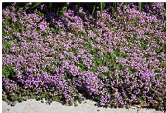
Elfin Creeping Thyme in bloom