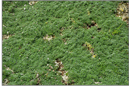
Elfin Creeping Thyme

This plant should only be grown in full sunlight. It prefers to grow in average to dry locations, and dislikes excessive moisture. It is considered to be drought-tolerant, and thus makes an ideal choice for a low-water garden or xeriscape application. It is not particular as to soil type or pH. It is highly tolerant of urban pollution and will even thrive in inner city environments. Consider covering it with a thick layer of mulch in winter to protect it in exposed locations or colder microclimates. This is a selected variety of a species not originally from North America. It can be propagated by division; however, as a cultivated variety, be aware that it may be subject to certain restrictions or prohibitions on propagation.