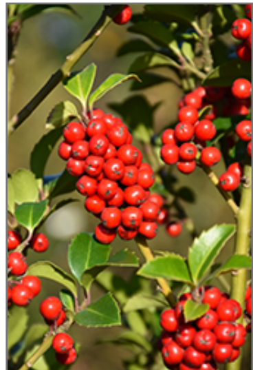
Castle Spire Meserve Holly fruit