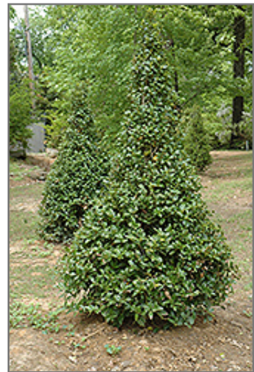
Castle Spire Meserve Holly