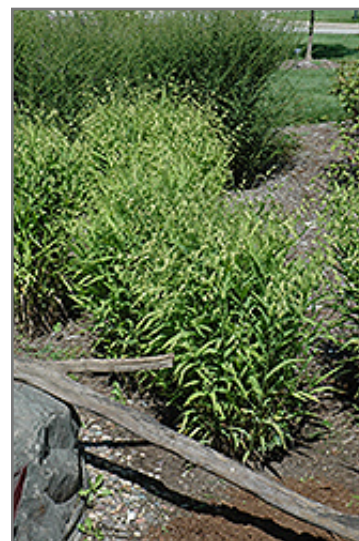
Northern Sea Oats