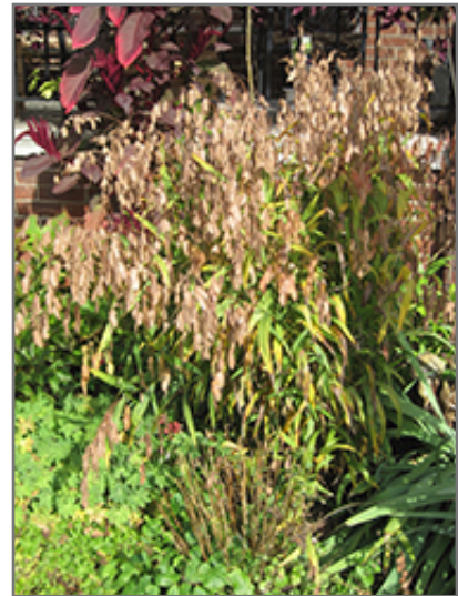
Northern Sea Oats

Northern Sea Oats is a fine choice for the garden, but it is also a good selection for planting in outdoor pots and containers. Because of its height, it is often used as a 'thriller' in the 'spiller-thriller-filler' container combination; plant it near the center of the pot, surrounded by smaller plants and those that spill over the edges. It is even sizeable enough that it can be grown alone in a suitable container. Note that when growing plants in outdoor containers and baskets, they may require more frequent waterings than they would in the yard or garden.