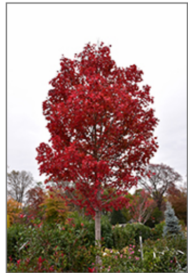
October Glory Red Maple in fall