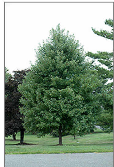
October Glory Red Maple