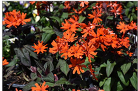
Orange Gnome Champion flowers