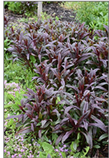
Dark Towers Beard Tongue

Dark Towers Beard Tongue is a fine choice for the garden, but it is also a good selection for planting in outdoor pots and containers. With its upright habit of growth, it is best suited for use as a 'thriller' in the 'spiller-thriller-filler' container combination; plant it near the center of the pot, surrounded by smaller plants and those that spill over the edges. It is even sizeable enough that it can be grown alone in a suitable container. Note that when growing plants in outdoor containers and baskets, they may require more frequent waterings than they would in the yard or garden.