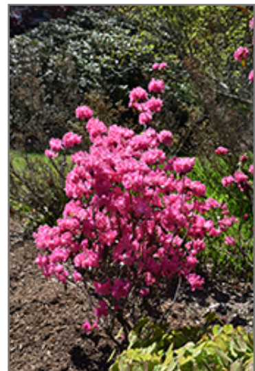
Landmark Rhododendron in bloom