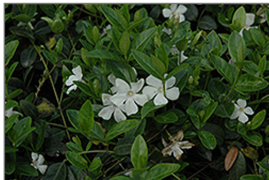
White Periwinkle flowers