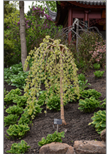
Chaparral Weeping Mulberry in bloom

This shrub performs well in both full sun and full shade. It is very adaptable to both dry and moist locations, and should do just fine under average home landscape conditions. It is considered to be drought-tolerant, and thus makes an ideal choice for xeriscaping or the moisture-conserving landscape. It is not particular as to soil type or pH, and is able to handle environmental salt. It is highly tolerant of urban pollution and will even thrive in inner city environments. This is a selected variety of a species not originally from North America.