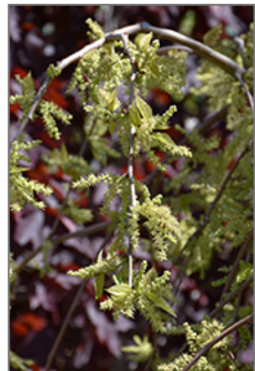
Chaparral Weeping Mulberry flowers