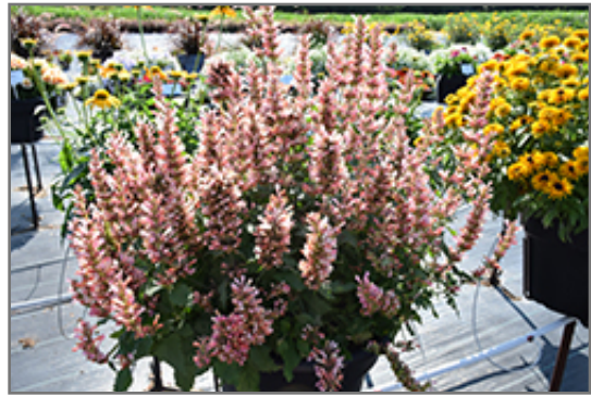
Pink Pearl Hyssop in bloom

Pink Pearl Hyssop will grow to be about 8 inches tall at maturity extending to 16 inches tall with the flowers, with a spread of 16 inches. It grows at a fast rate, and under ideal conditions can be expected to live for approximately 6 years. As an herbaceous perennial, this plant will usually die back to the crown each winter, and will regrow from the base each spring. Be careful not to disturb the crown in late winter when it may not be readily seen!