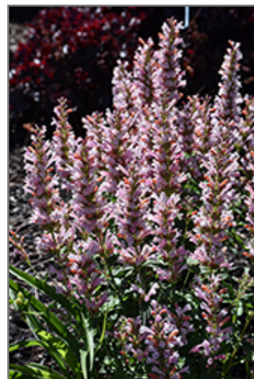
Pink Pearl Hyssop flowers

This is a relatively low maintenance plant, and is best cleaned up in early spring before it resumes active growth for the season. It is a good choice for attracting bees, butterflies and hummingbirds to your yard, but is not particularly attractive to deer who tend to leave it alone in favor of tastier treats. It has no significant negative characteristics.