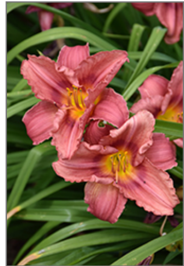
Happy Ever Appster Rosy Returns Daylily flowers

This is a relatively low maintenance plant, and is best cleaned up in early spring before it resumes active growth for the season. It is a good choice for attracting butterflies to your yard. It has no significant negative characteristics.