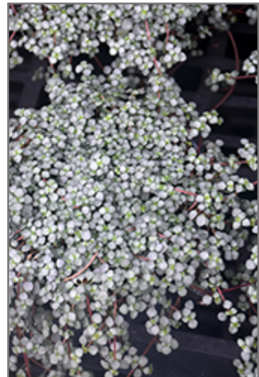
Aquamarine Pilea foliage