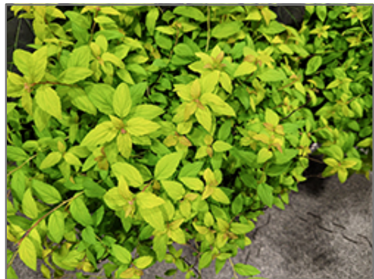
Little Spark Spirea foliage