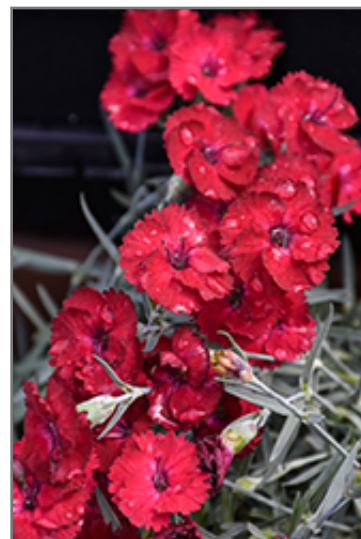
Mountain Frost Red Garnet Pinks flowers