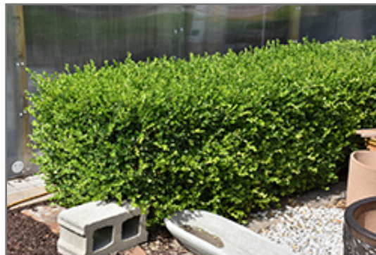
NewGen Independence Boxwood