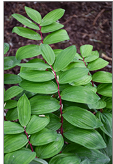
Ruby Slippers Solomon's Seal foliage

Ruby Slippers Solomon's Seal is recommended for the following landscape applications;