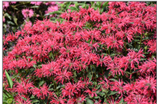
Upscale Red Velvet Beebalm flowers

Upscale Red Velvet Beebalm is an herbaceous perennial with a mounded form. Its medium texture blends into the garden, but can always be balanced by a couple of finer or coarser plants for an effective composition.