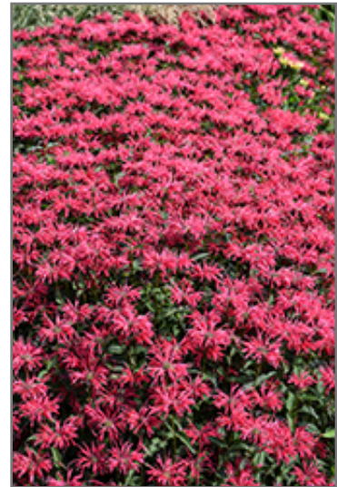
Upscale Red Velvet Beebalm flowers

Upscale Red Velvet Beebalm is a fine choice for the garden, but it is also a good selection for planting in outdoor pots and containers. Because of its height, it is often used as a 'thriller' in the 'spiller-thriller-filler' container combination; plant it near the center of the pot, surrounded by smaller plants and those that spill over the edges. It is even sizeable enough that it can be grown alone in a suitable container. Note that when growing plants in outdoor containers and baskets, they may require more frequent waterings than they would in the yard or garden.