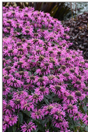
Upscale Lavender Taffeta Beebalm flowers

This plant will require occasional maintenance and upkeep, and should be cut back in late fall in preparation for winter. It is a good choice for attracting bees, butterflies and hummingbirds to your yard, but is not particularly attractive to deer who tend to leave it alone in favor of tastier treats. Gardeners should be aware of the following characteristic(s) that may warrant special consideration;