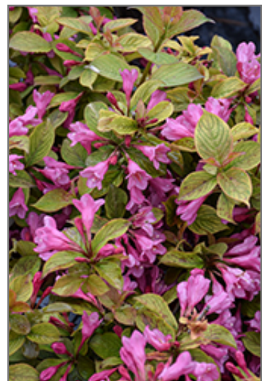
Midnight Sun Reblooming Weigela flowers