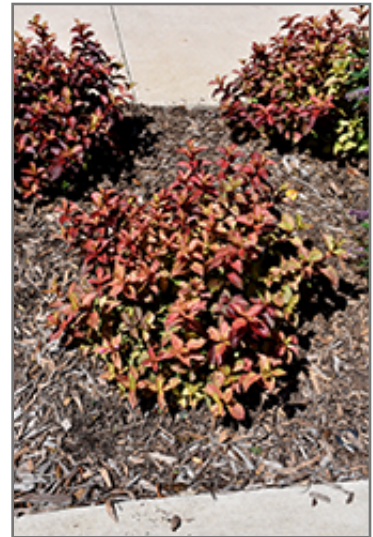
Midnight Sun Reblooming Weigela

Midnight Sun Reblooming Weigela makes a fine choice for the outdoor landscape, but it is also well-suited for use in outdoor pots and containers. It is often used as a 'filler' in the 'spiller-thriller-filler' container combination, providing a mass of flowers and foliage against which the thriller plants stand out. Note that when grown in a container, it may not perform exactly as indicated on the tag - this is to be expected. Also note that when growing plants in outdoor containers and baskets, they may require more frequent waterings than they would in the yard or garden.