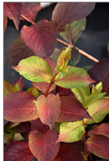
Midnight Sun Reblooming Weigela foliage