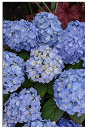
Let's Dance Sky View Hydrangea flowers

Let's Dance Sky View Hydrangea makes a fine choice for the outdoor landscape, but it is also well-suited for use in outdoor pots and containers. Because of its height, it is often used as a 'thriller' in the 'spiller-thriller-filler' container combination; plant it near the center of the pot, surrounded by smaller plants and those that spill over the edges. It is even sizeable enough that it can be grown alone in a suitable container. Note that when grown in a container, it may not perform exactly as indicated on the tag - this is to be expected. Also note that when growing plants in outdoor containers and baskets, they may require more frequent waterings than they would in the yard or garden.