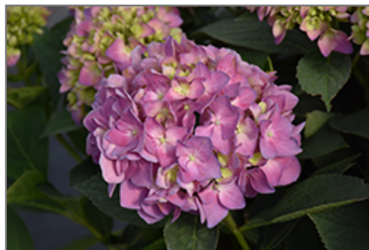
Let's Dance Sky View Hydrangea flowers