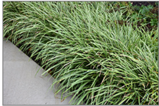
Ice Dance Sedge

Ice Dance Sedge will grow to be about 12 inches tall at maturity, with a spread of 15 inches. Its foliage tends to remain dense right to the ground, not requiring facer plants in front. It grows at a medium rate, and under ideal conditions can be expected to live for approximately 10 years. As an evergreen perennial, this plant will typically keep its form and foliage year-round.