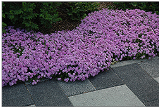
Fort Hill Moss Phlox in bloom