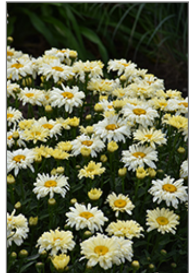
Amazing Daisies Banana Cream II Shasta Daisy flowers

Amazing Daisies Banana Cream II Shasta Daisy is a fine choice for the garden, but it is also a good selection for planting in outdoor pots and containers. With its upright habit of growth, it is best suited for use as a 'thriller' in the 'spiller-thriller-filler' container combination; plant it near the center of the pot, surrounded by smaller plants and those that spill over the edges. Note that when growing plants in outdoor containers and baskets, they may require more frequent waterings than they would in the yard or garden.