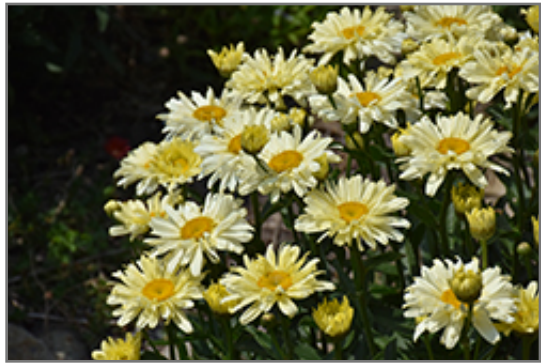
Amazing Daisies Banana Cream II Shasta Daisy flowers

Amazing Daisies Banana Cream II Shasta Daisy is an herbaceous perennial with an upright spreading habit of growth. Its medium texture blends into the garden, but can always be balanced by a couple of finer or coarser plants for an effective composition.