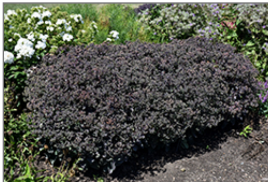
Night Light Stonecrop in bloom

Night Light Stonecrop is recommended for the following landscape applications;