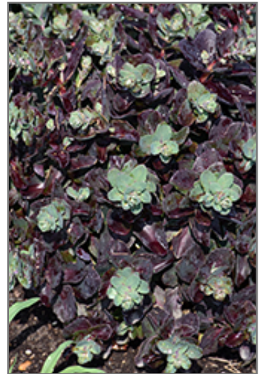
Night Light Stonecrop foliage

Night Light Stonecrop is a dense herbaceous perennial with an upright spreading habit of growth. Its relatively coarse texture can be used to stand it apart from other garden plants with finer foliage.