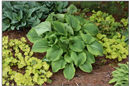
Twin Cities Hosta

Twin Cities Hosta is recommended for the following landscape applications;