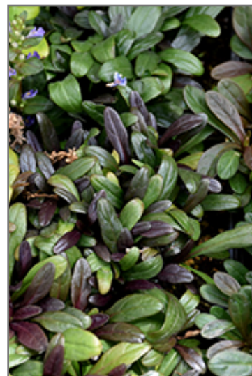
Feathered Friends Noble Nightingale Bugleweed foliage