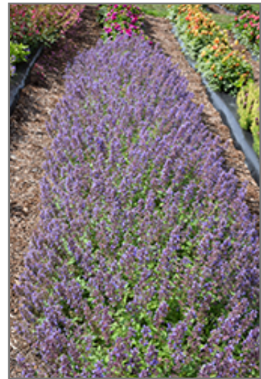
Whispurr Blue Catmint in bloom