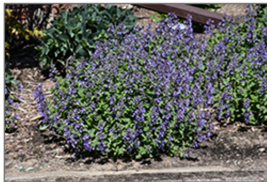
Picture Purrfect Catmint in bloom