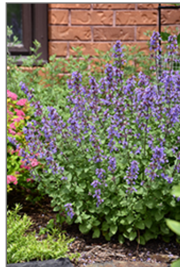
Picture Purrfect Catmint flowers

Picture Purrfect Catmint is a dense herbaceous perennial with a mounded form. Its relatively fine texture sets it apart from other garden plants with less refined foliage.