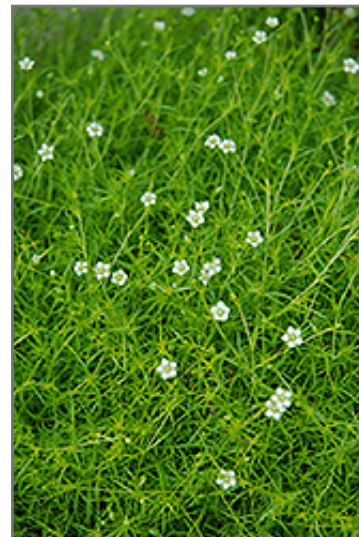
Scotch Moss flowers

Scotch Moss will grow to be only 1 inch tall at maturity, with a spread of 12 inches. Its foliage tends to remain low and dense right to the ground. It grows at a medium rate, and under ideal conditions can be expected to live for approximately 10 years. As an evergreen perennial, this plant will typically keep its form and foliage year-round.