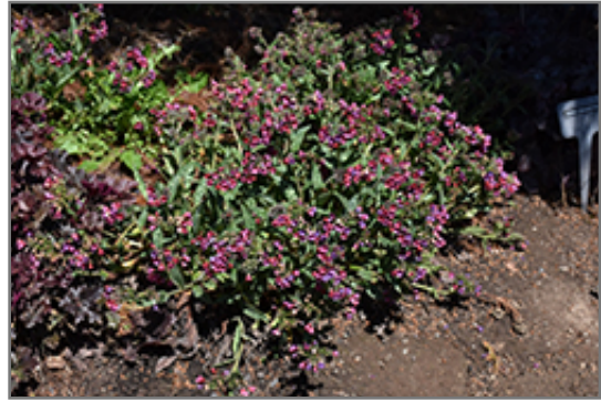
Raspberry Splash Lungwort in bloom

Raspberry Splash Lungwort will grow to be about 12 inches tall at maturity, with a spread of 18 inches. When grown in masses or used as a bedding plant, individual plants should be spaced approximately 15 inches apart. Its foliage tends to remain dense right to the ground, not requiring facer plants in front. It grows at a medium rate, and under ideal conditions can be expected to live for approximately 10 years. As an herbaceous perennial, this plant will usually die back to the crown each winter, and will regrow from the base each spring. Be careful not to disturb the crown in late winter when it may not be readily seen!