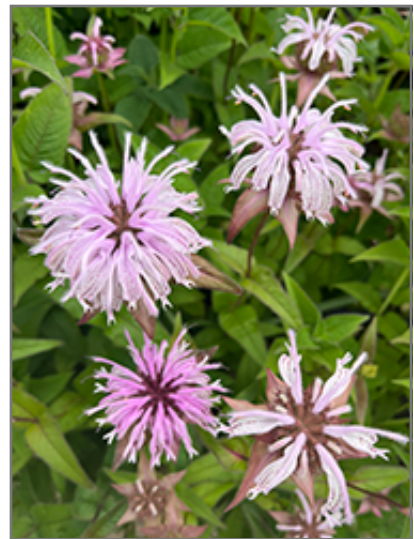
Eastern Beebalm flowers

This plant will require occasional maintenance and upkeep, and should be cut back in late fall in preparation for winter. It is a good choice for attracting bees, butterflies and hummingbirds to your yard, but is not particularly attractive to deer who tend to leave it alone in favor of tastier treats. Gardeners should be aware of the following characteristic(s) that may warrant special consideration;