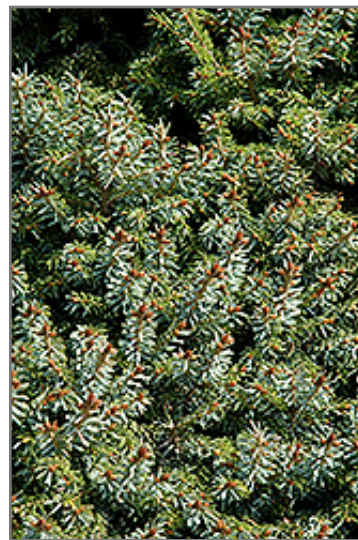
Dwarf Serbian Spruce foliage