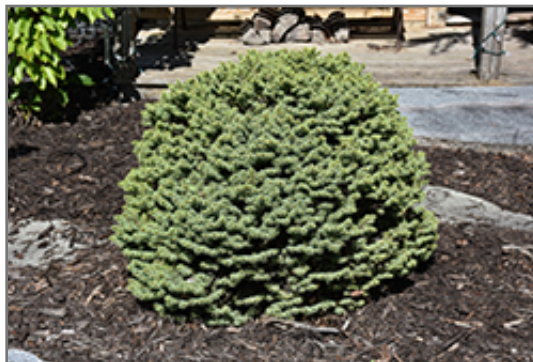
Dwarf Serbian Spruce