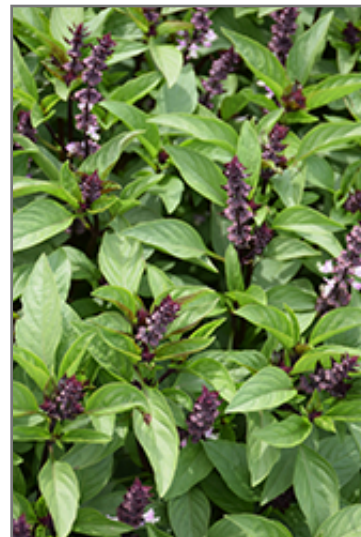
Sweet Basil flowers

Sweet Basil is a good choice for the edible garden, but it is also well-suited for use in outdoor pots and containers. It is often used as a 'filler' in the 'spiller-thriller-filler' container combination, providing the canvas against which the larger thriller plants stand out. Note that when growing plants in outdoor containers and baskets, they may require more frequent waterings than they would in the yard or garden.