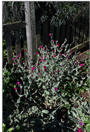
Rose Campion in bloom