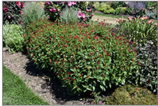
Little Redhead Indian Pink in bloom

Little Redhead Indian Pink will grow to be about 20 inches tall at maturity, with a spread of 24 inches. When grown in masses or used as a bedding plant, individual plants should be spaced approximately 20 inches apart. Its foliage tends to remain dense right to the ground, not requiring facer plants in front. It grows at a fast rate, and under ideal conditions can be expected to live for approximately 5 years. As an herbaceous perennial, this plant will usually die back to the crown each winter, and will regrow from the base each spring. Be careful not to disturb the crown in late winter when it may not be readily seen!