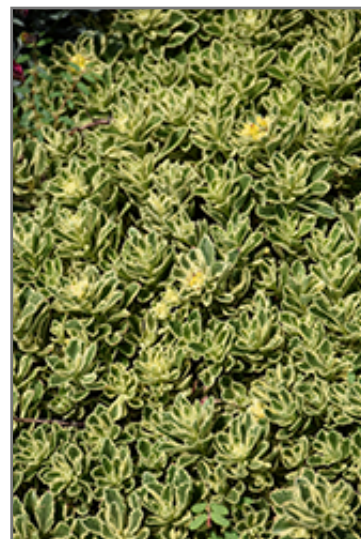
Rock 'N Low Boogie Woogie Stonecrop