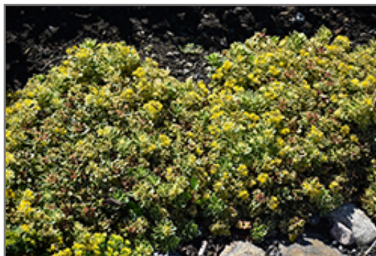
Rock 'N Low Boogie Woogie Stonecrop in bloom