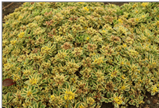
Rock 'N Low Boogie Woogie Stonecrop flowers

Rock 'N Low Boogie Woogie Stonecrop is a dense herbaceous perennial with a mounded form. Its medium texture blends into the garden, but can always be balanced by a couple of finer or coarser plants for an effective composition.