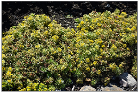
Rock 'N Low Boogie Woogie Stonecrop in bloom