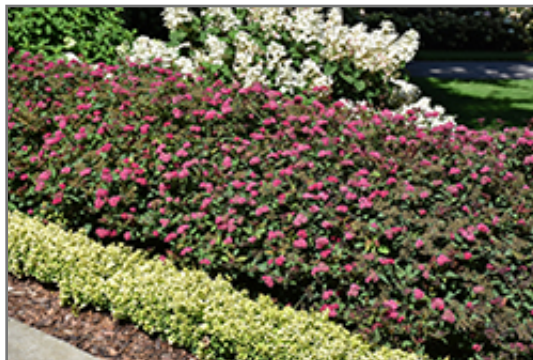
Double Play Doozie Spirea in bloom

This shrub will require occasional maintenance and upkeep, and is best pruned in late winter once the threat of extreme cold has passed. It is a good choice for attracting butterflies to your yard, but is not particularly attractive to deer who tend to leave it alone in favor of tastier treats. It has no significant negative characteristics.