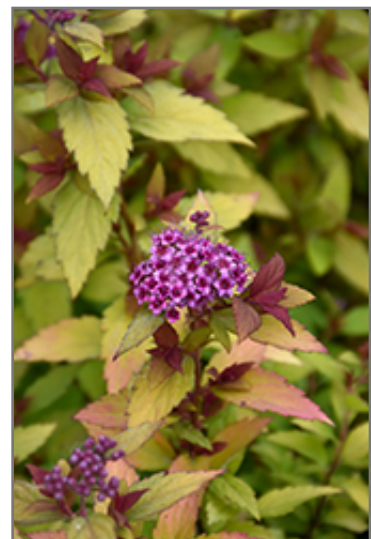
Poprocks Rainbow Fizz Spirea flowers