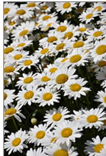
Becky Shasta Daisy flowers