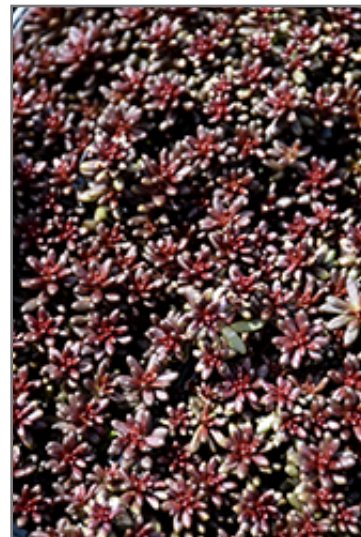
Coral Carpet Stonecrop

Coral Carpet Stonecrop is a fine choice for the garden, but it is also a good selection for planting in outdoor pots and containers. Because of its spreading habit of growth, it is ideally suited for use as a 'spiller' in the 'spiller-thriller-filler' container combination; plant it near the edges where it can spill gracefully over the pot. Note that when growing plants in outdoor containers and baskets, they may require more frequent waterings than they would in the yard or garden.