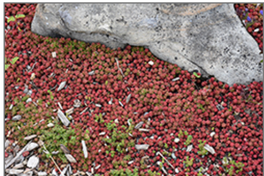
Coral Carpet Stonecrop

Coral Carpet Stonecrop is a dense herbaceous evergreen perennial with a ground-hugging habit of growth. Its medium texture blends into the garden, but can always be balanced by a couple of finer or coarser plants for an effective composition.