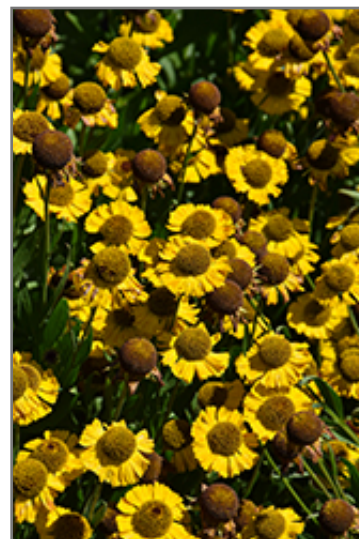
Salud Golden Sneezeweed flowers