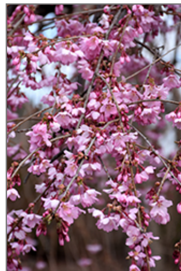
Pink Cascade Weeping Cherry flowers