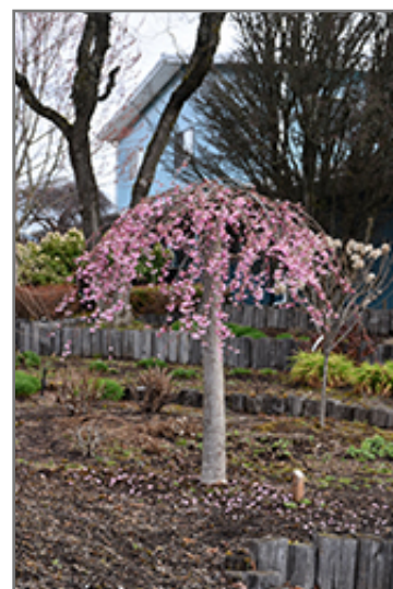
Pink Cascade Weeping Cherry in bloom