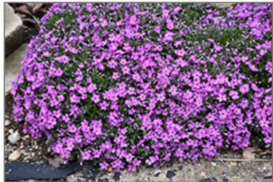
Rocky Road Pink Phlox in bloom